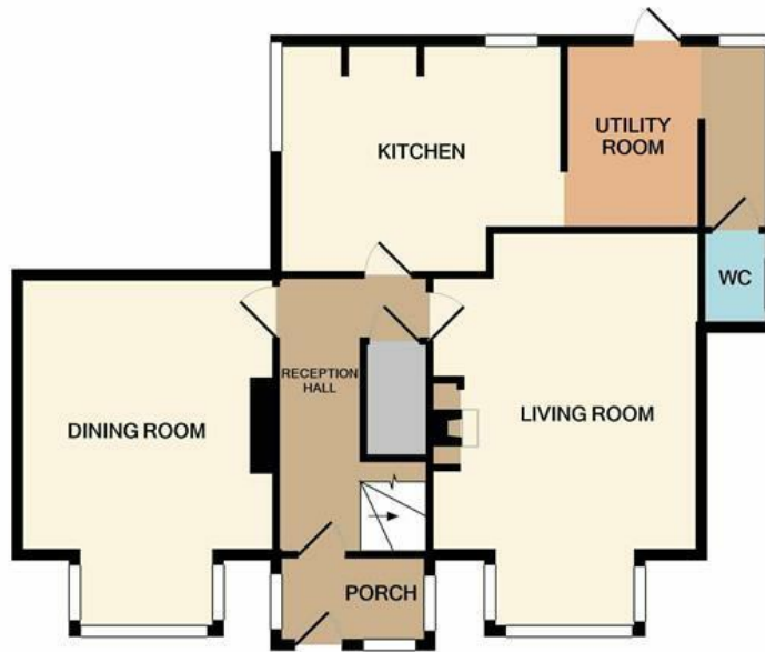
GROUND FLOOR APPROX. FLOOR AREA 624 SQ.FT. (57.9 SQ.M.)