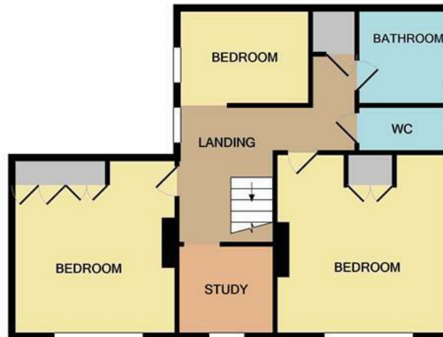
1ST FLOOR APPROX. FLOOR AREA 520 SQ.FT. (48.3 SQ.M.) TOTAL APPROX. FLOOR AREA 1143 SQ.FT. (106.2 SQ.M.)